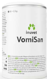
Tablets for omnivores