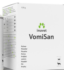
Sachets for the lil' ones