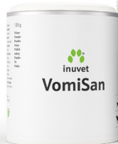
Powder for allergy warriors