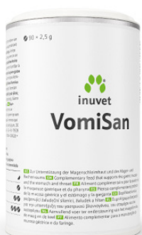
Tablets for omnivores