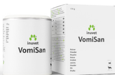
Powder for the allergy stricken